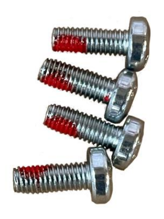
Step 3: When all 4 screws are fastened, the seat is ready to be mounted on the gas spring and base.